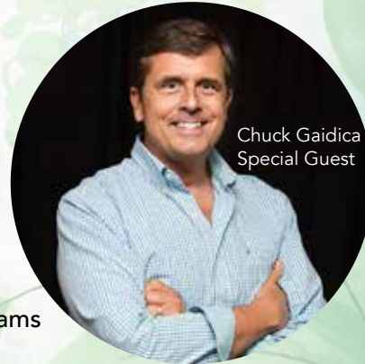
Chuck Gaidica Special Guest

100% of ticket price benefits the caring programs of Angela Hospice.