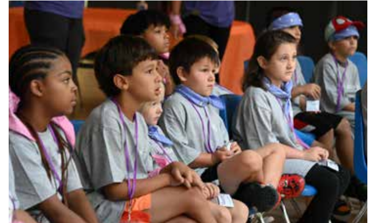
CAMPERS WERE ASKED WHAT THEY LEARNED LAST YEAR AT CAMP MONARCH. HERE ARE SOME OF THEIR RESPONSES: